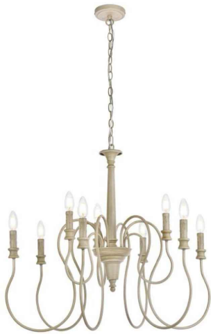
Weathered Dove Item No:LD7045D30WD