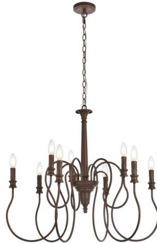
Wooden Item No:LD7045D30WOK